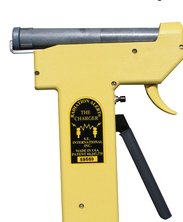
The Radiation Alert<sup>®</sup> Dosimeter Charger (Shown Above) can recharge Pen Dosimeters without batteries

±10% of true dose for Cs<sup>137</sup> or Co<sup>60</sup> gamma.